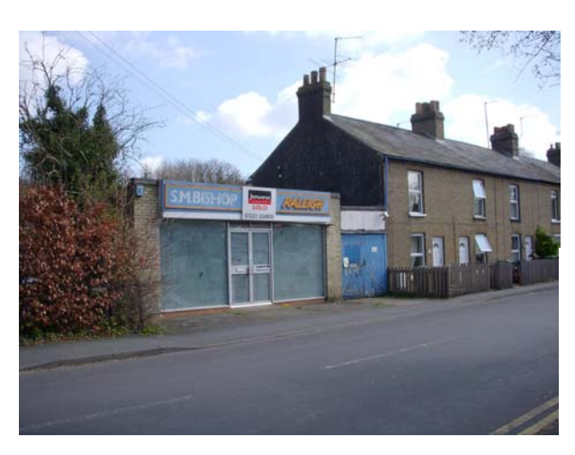
Bishop's Cycles in Histon Conservation Area, where consent has been granted for its demolition but the demolition cannot commence until consent has been granted for the redevelopment of the site