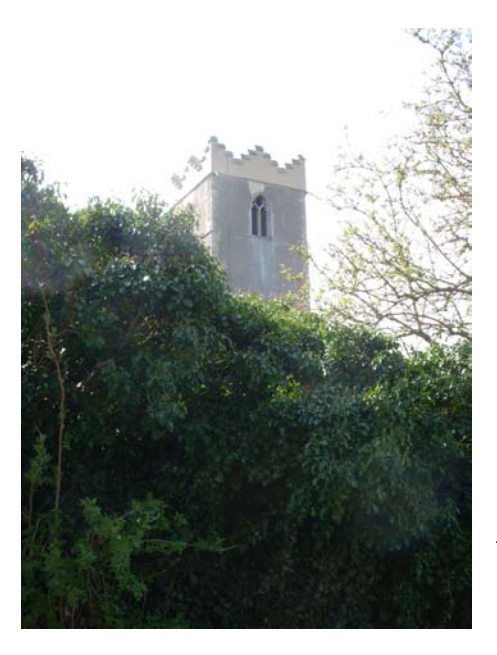
An important view towards a church that should be retained and protected from infill development.

2.1 Many villages include gap sites that are physically large enough to accommodate infill development. In considering any proposal for such site the District Council will consider the value of that site as open ground in the Conservation Area and the contribution it makes to the Conservation Area. Gap sites frequently afford views through the area, sometimes to a key building (such as the church) or to open countryside beyond the village framework.