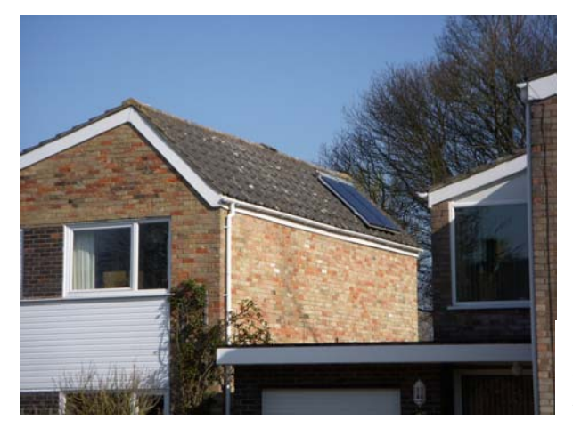
Discretely located solar panel on a side elevation of a 20<sup>th</sup> century house in the Fulbourn Conservation Area

6.4 Wind turbines are more likely to be visually intrusive in a Conservation Area and may also result in noise and disturbance to others. Planning permission will only be granted for their installation where it is clearly demonstrated that no harm will result.